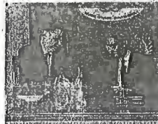
ਪ੍ਰੋ. ਕਾਨਫਰੰਸ ਦੌਰਾਨ ਹੱਥ ਮਿਲਾਉਂਦੇ ਸ਼ੀ ਜਿਨਪਿੰਗ ਤੇ ਪਾਲ ਕਰਾਮੇ।

ਪਹਿਲੀ ਵਾਰ ਰਵਾਂਡਾ ਯਾਤਰਾ 'ਤੇ ਪੁੱਜੇ ਦੇਵੇਂ ਨੇਤਾ, ਕੁਨੈਕਟੀਵਿਟੀ ਪ੍ਰਾਜੈਕਟਾਂ ਨੂੰ ਦੇਖਦਿਆਂ ਭਾਰਤ ਤੇ ਚੀਨ ਲਈ ਅਗਿਆਤ ਵਾਰੀ